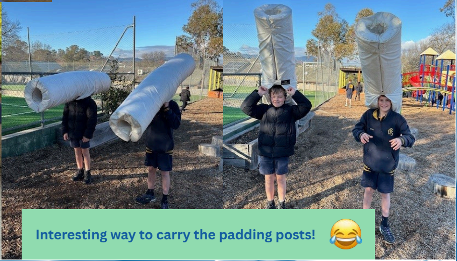
Interesting way to carry the padding posts! 😂